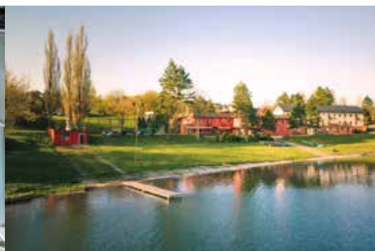
Unconventional facilities for your events