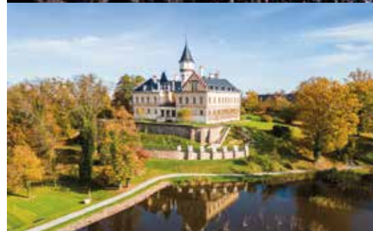
Events at the chateau