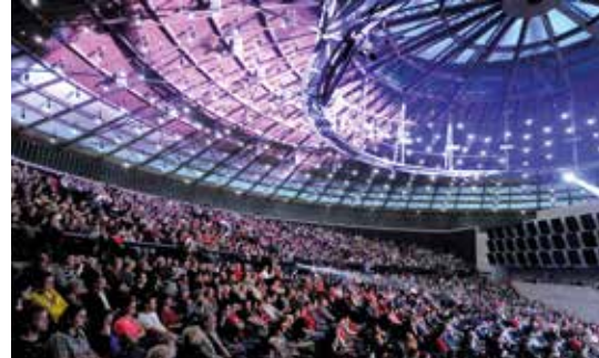
Festive meeting places